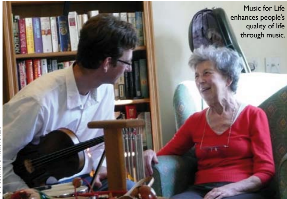
Music for Life enhances people's quality of life through music.

The Westbourne Green Surgery, Health @ The Stowe 260 Harrow Road, W2 020 7289 2810